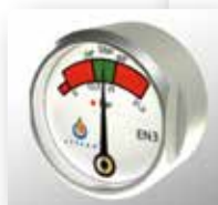
Membrane pressure gauge