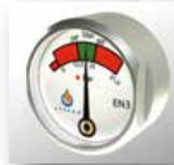
Membrane pressure gauge