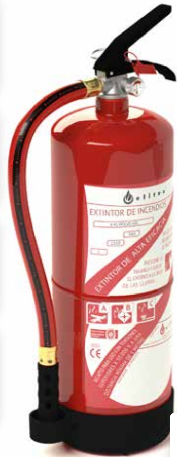
Venturi effect nozzle