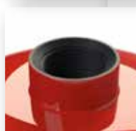
Steely neck ring