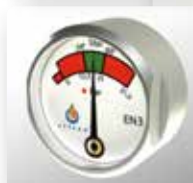
Membrane pressure gauge