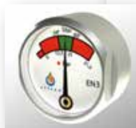
Membrane pressure gauge