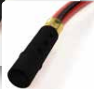
Venturi effect nozzle