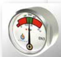
Membrane pressure gauge