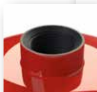
Steely neck ring