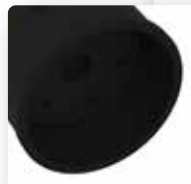
Shower effect nozzle