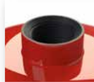
Steely neck ring