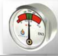
Membrane pressure gauge