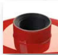
Steely neck ring