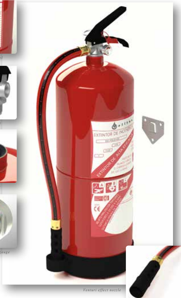
Venturi effect nozzle