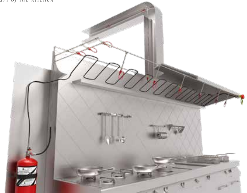
Top part of the kitchen